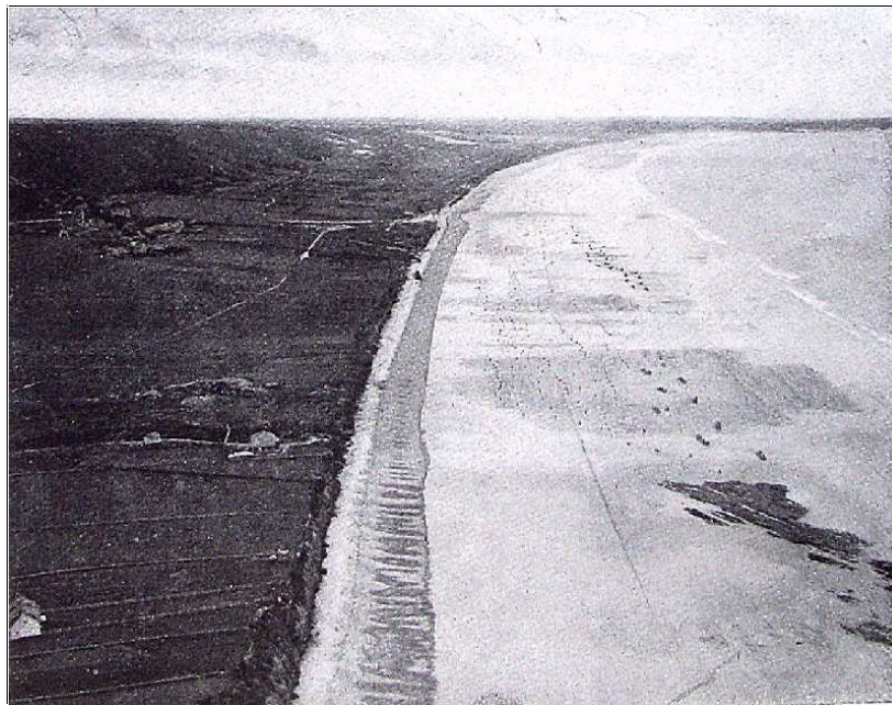
Aerial view of a beach on the coast of France at low tide shows the Obstacles that the enemy hoped would stop the Allied landing craft

D-Day had been set as June 5th, but the forecast of unfavorable weather for the landing on that date resulted in the decision to postpone the attack one day. Beginning on June 4th, and following carefully arranged Naval plans, the great armada made up of the several assault forces of the Western Naval Task Force sailed out into the English Channel, slowest convoys first, fastest ships last. All were escorted, protected on the sea by units of the American and British Navies and in the air by a cover of Allied aircraft. Apparently either the German command was caught off guard or the German air and naval forces in France were so battered by the incessant Allied aerial bombardment that they were unable to oppose the crossing, and in the darkness of the short summer night these thousands of ships and boats assembled unmolested in their designated areas just off the French coast. Then, at the appointed hour, the naval crews went quietly about their well-rehearsed task of transferring the first waves of troops and equipment to the small, speedy landing craft which would carry them to the beaches.