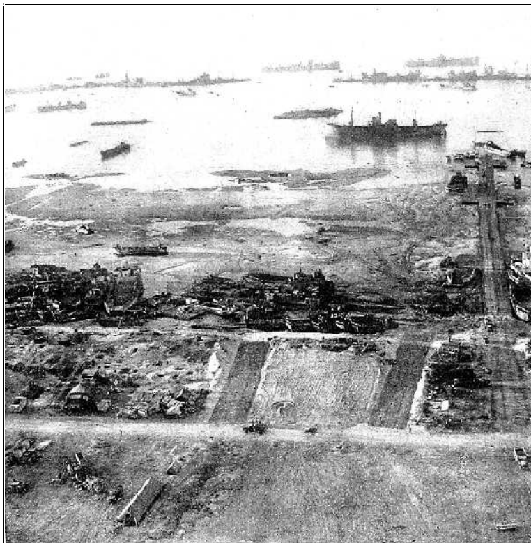
This aerial view of part of the beach area shows an artificial breakwater made of sunken ships. Other craft, "dried out" by the receding tide will float again when the water rises.

Reinforcements continued to flow ashore, and soon the 90th and 9th Infantry Divisions joined the battle. The enemy had retired west of the Merderet River, but not without making our gains as costly as possible. He persistently launched small counterattacks late every evening in a series of attempts to regain ground lost during the day, but every one was decisively beaten off. He still held Carentan, preventing the juncture of VII Corps with V Corps. His defense in the fixed fortifications along the coast was tenacious, and our advance was slow.