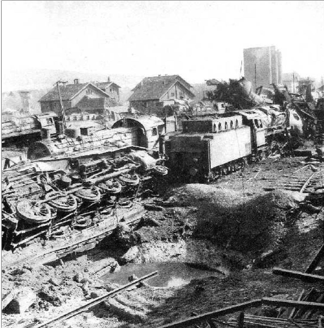
Aerial bombardment disrupted German rail schedules and prevented rapid movement of their reserves.

As the VII Corps pushed West and then north, responsibility for holding the defensive fronts to the south passed to VIII Corps. Successively, the 101st Airborne, the 82d Airborne, and the 90th Infantry Divisions were transferred to that command.