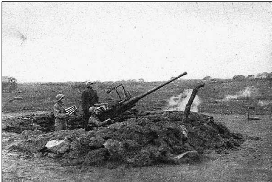
Anti-aircraft guns like this 40 mm Bofors protected the Corps in England and on the continent.

To prevent the arrival of additional reinforcements for the Cherbourg defenders and to forestall any orderly withdrawal of troops from the Cherbourg area, the VII Corps attacked west across the base of the peninsula. The 90th Infantry Division met stubborn resistance as it led off this attack, but the drive gained momentum with the commitment of the 82d Airborne and 9th Infantry Divisions. On the evening of June 17th, the troops of Maj. Gen. Marton S. Eddy's 9th Division reached the west coast near Barneville sur Mer, isolating the enemy forces on the Cotentin Peninsula.