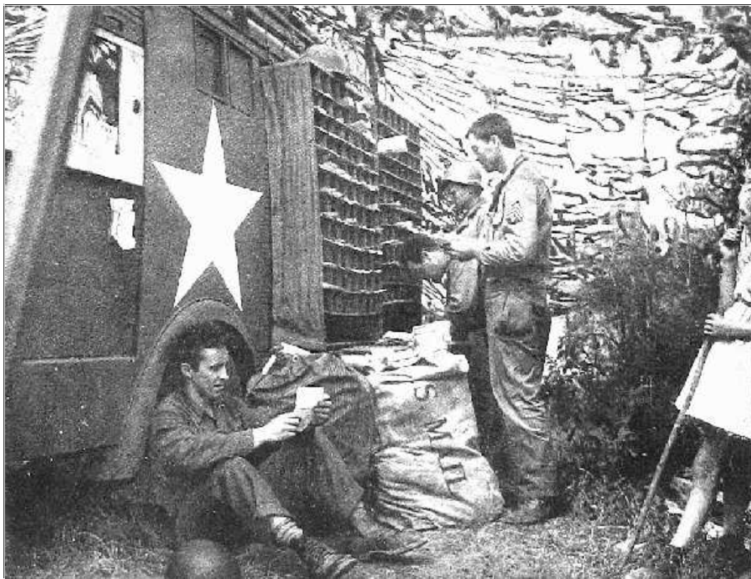
Mobile Army post Office like this kept the boys happy with prompt delivery of letters from home. This one was set up in a field near Cherbourg.

The hour for the assault landing had been carefully selected for the most favorable conditions of tide and light, and at 0630 hours the first wave of LCVP's touched down and disgorged their cargoes on Utah Beach. Resistance was light. The beach defenders were quickly driven from their pillboxes and strong-points, and in a very few minutes fighting units of the 4th Infantry Division had assembled and were advancing inland across the inundated areas just off the beach.