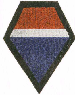
12 TH ARMY GROUP