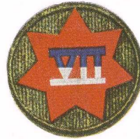
7 TH CORPS