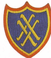
20 TH CORPS