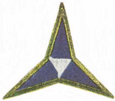
3 RD CORPS