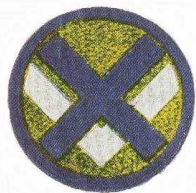
15 TH CORPS