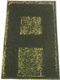
1 ST ARMY