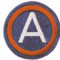
3 RD ARMY