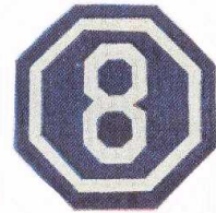
8 TH CORPS