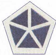
5 TH CORPS