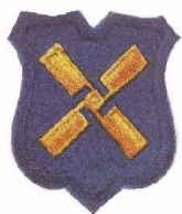
12 TH CORPS